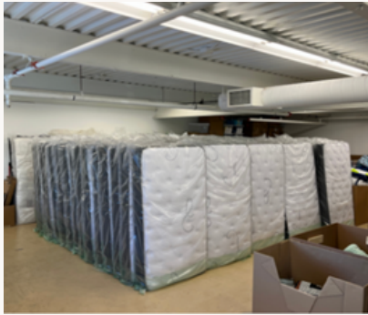
Our storage area

After we finish the Dream Kits, we'll move bed frames and mattresses into the truck. We'll also load all the Dream Kits.