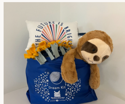
A Dream Kit