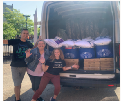
The truck ready to go!