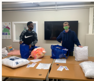
Assembling a Dream Kit