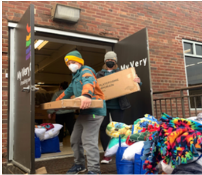
Volunteers loading the truck