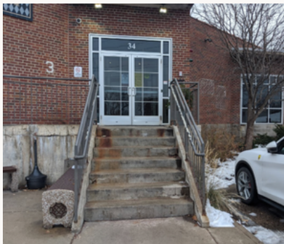
Go in this door and turn right

MVOB is located in the Keg House Arts building in NE. Our address is 34 13th Ave NE Suite 106, Minneapolis, MN 55413. Here's how to find our office: